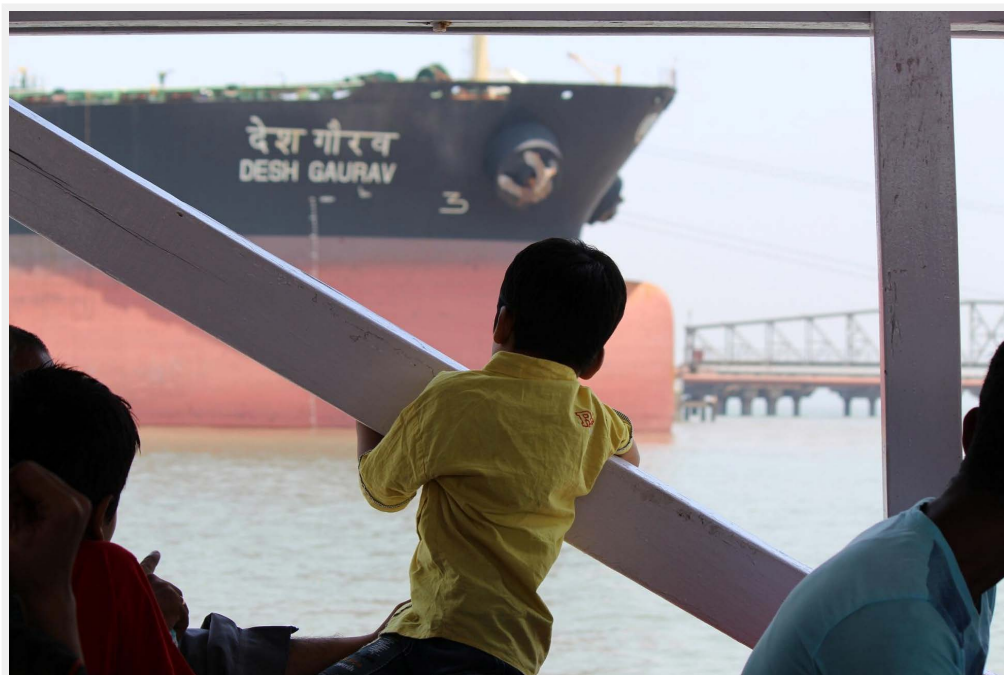
The India flagged Desh Gaurav crude oil tanker outside of Mumbai. Republicans like India as a potential importer of American LNG.