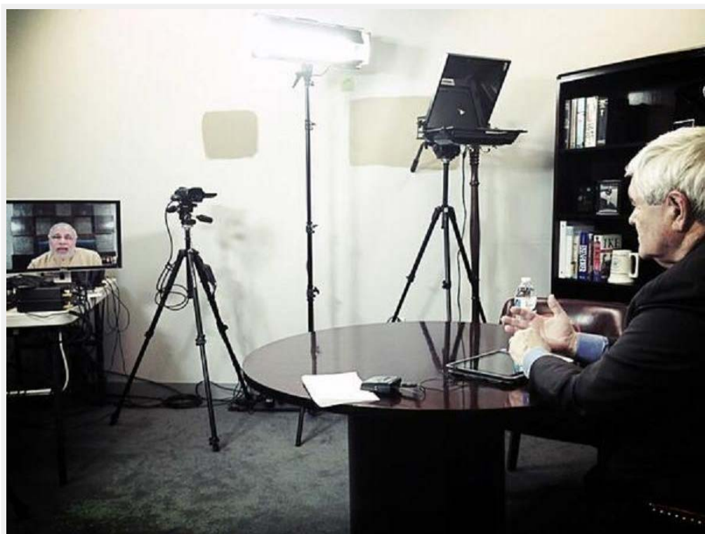
Newt Gingrich in a Skype call with India's Prime Minister Narendra Modi last year. Some Republicans liken Modi to Reagan.

Lockheed Martin builds the C-130 in Hyderabad, with the handiwork of its partner, Tata Advanced Systems. Tata also builds the main cabin for the Sikorsky S-92 helicopter in the same city.